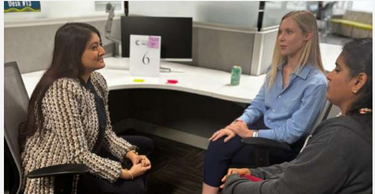
2025 HealthTech|X Mentor Surge