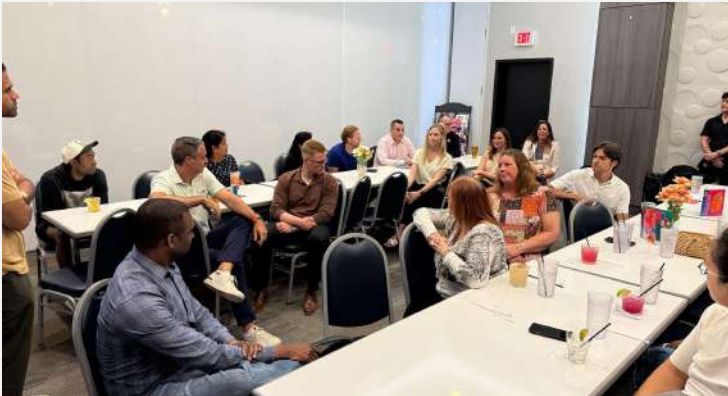
Cohort Bonding at a Team Dinner