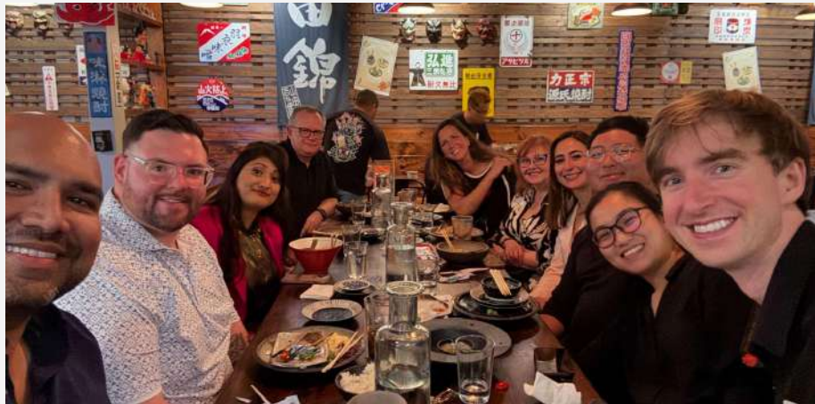
Cohort Happy Hour!