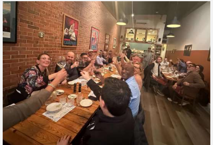
Cohort Dinner at Spartacos