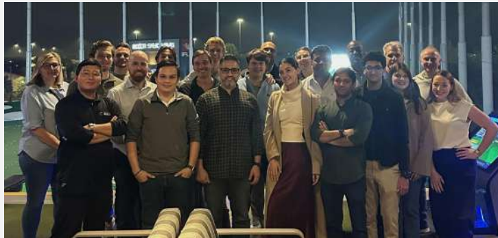
Cohort Event at Top Golf