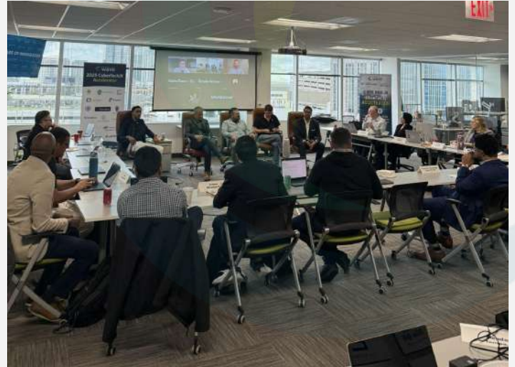
Session Scenes at Tampa Bay Wave Office