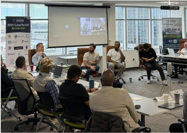
Alumni Panel with Guardian Sat, Harness, and Founder/Former CEO of Peerfit