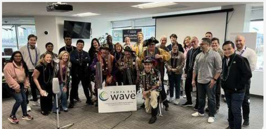
Cohort visited by Tampa Bay pirates (