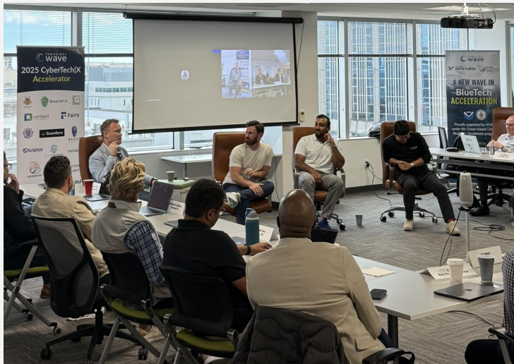
Alumni Panel with Guardian Sat, Harness, and Founder/Former CEO of Peerfit