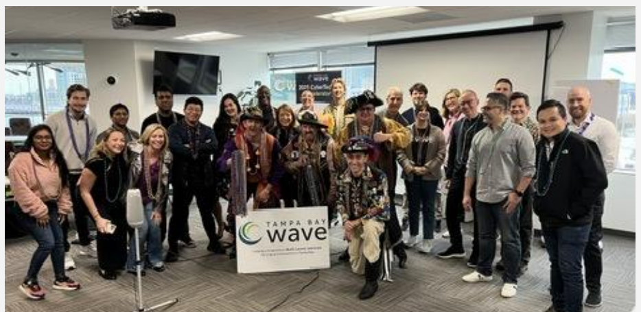
Cohort visited by Tampa Bay pirates (