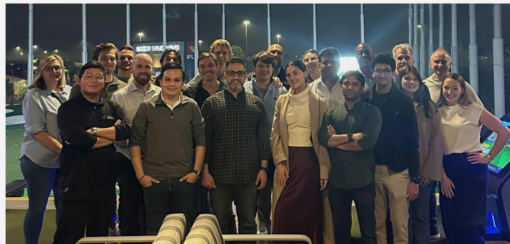
Cohort Event at Top Golf