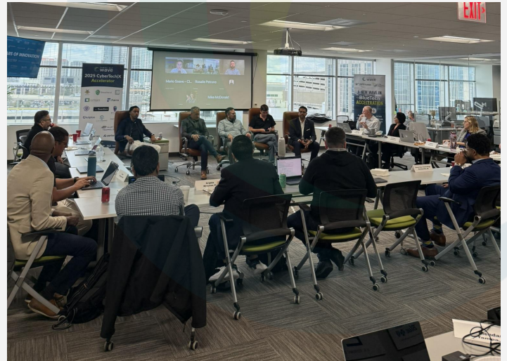
Session Scenes at Tampa Bay Wave Office