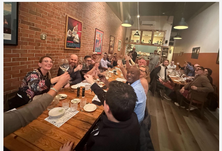
Cohort Dinner at Spartacos